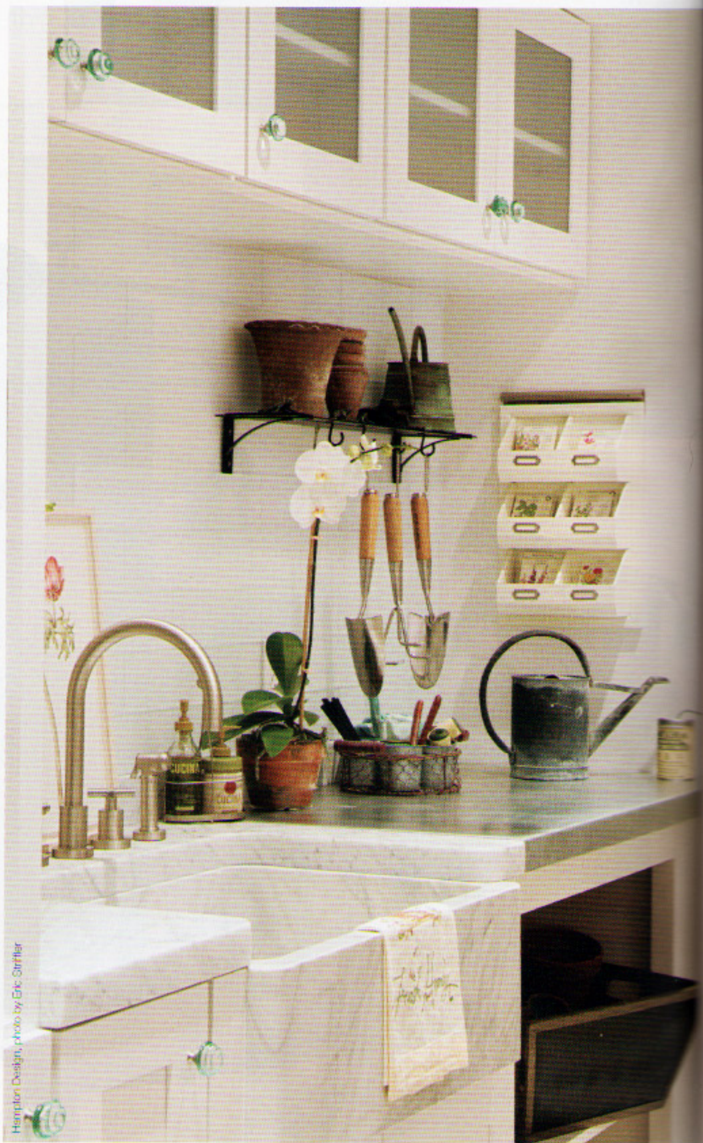
Hampton Design, photo by Eric Striffler

ABOVE: Honey-toned cabinetry makes room for storage and a built-in desk area.